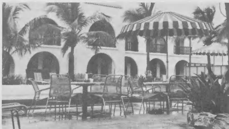
New 2-story wing of Strand Hotel. Adición nobo di 2 piso na Strand Hotel.